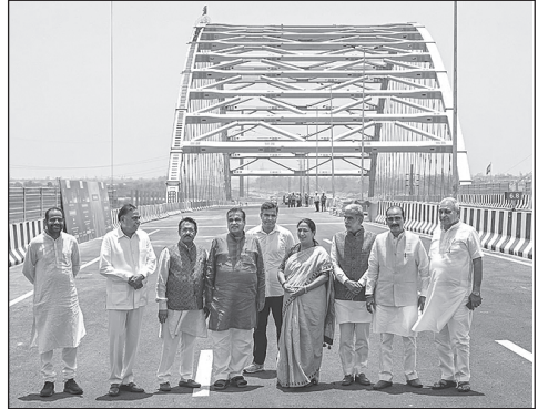
Union Minister of Road Transport and Highways Nitin Gadkari along with Chief Minister of Delhi Rekha Gupta and others conduct a joint on-site inspection of the Delhi-Mumbai Expressway Link (NH-148 NA) project, New Delhi on Tuesday.

The agency is attempting to ascertain the source of the assets in his possession and to determine whether any attempts were made to launder illicit funds.